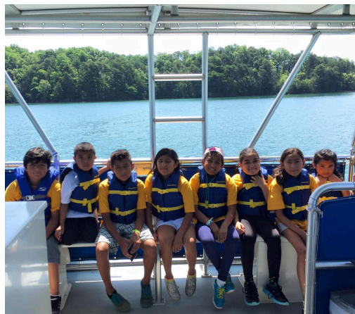
Lake Lanier Islands