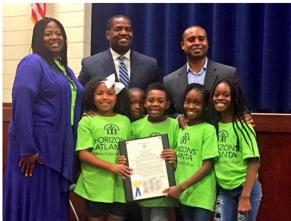
National Summer Learning Day