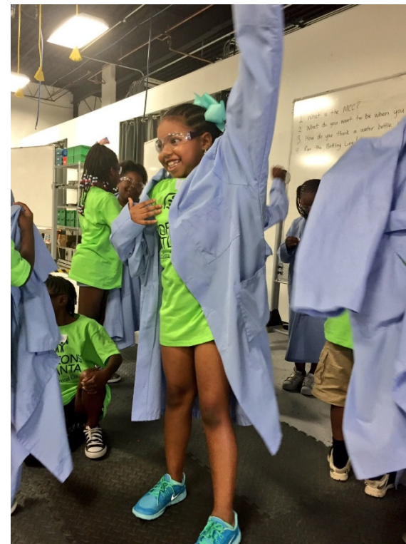
McKinsey Design Lab