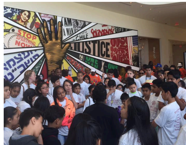
Center for Civil & Human Rights